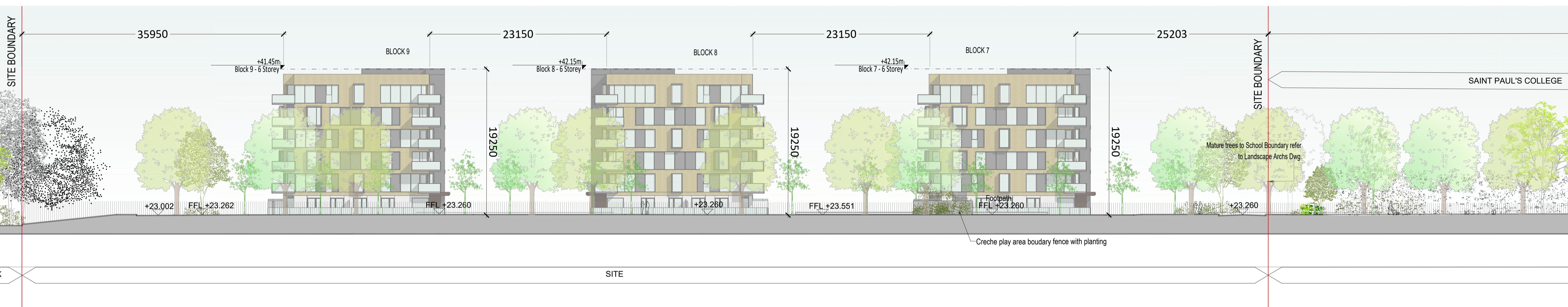
SITE SECTION B-B (PART 1) 1/250